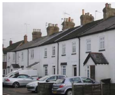
Chandler family, 1891 census, Newtown Road, New Denham